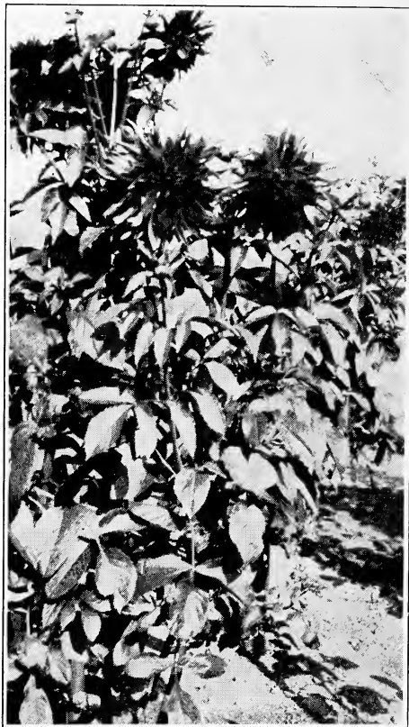
Ft. Monmouth grown in California from one of our plants delayed 13 days in transit. Tall plant extreme upper left, Ohio Giant.

F. W. BUTLER F. D. (Boston)—An unusual shade of orange with exceptionally deep petals regularly formed. One of the largest of its type on excellent stems. At the 1929 San Francisco Show it was the largest perfect bloom. Stock very limited. $10.00 each, Plants, $5.00 Net.